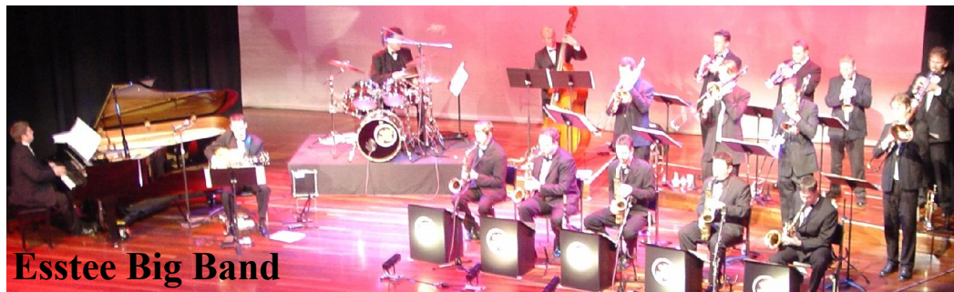
Esstee Big Band