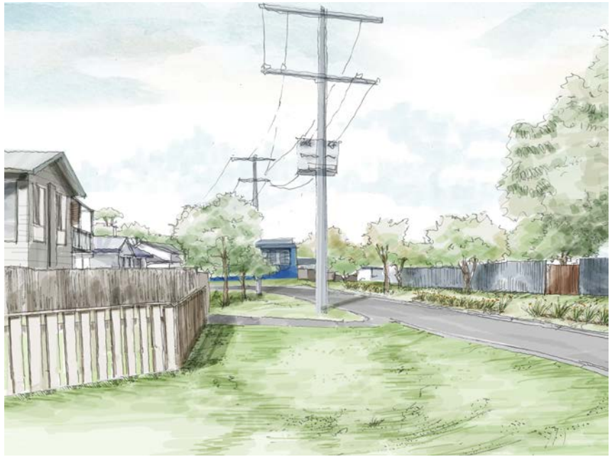
Pioneer Bay Landscaping Sketch looking South on Wendy Street