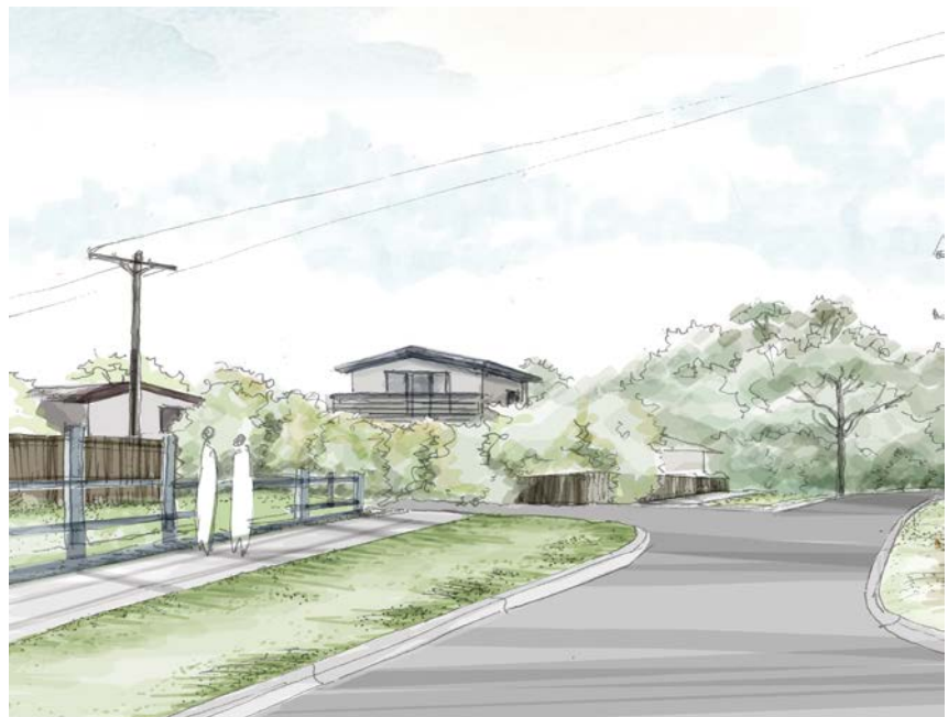
Pioneer Bay Landscaping Sketch looking East on Kallay Drive